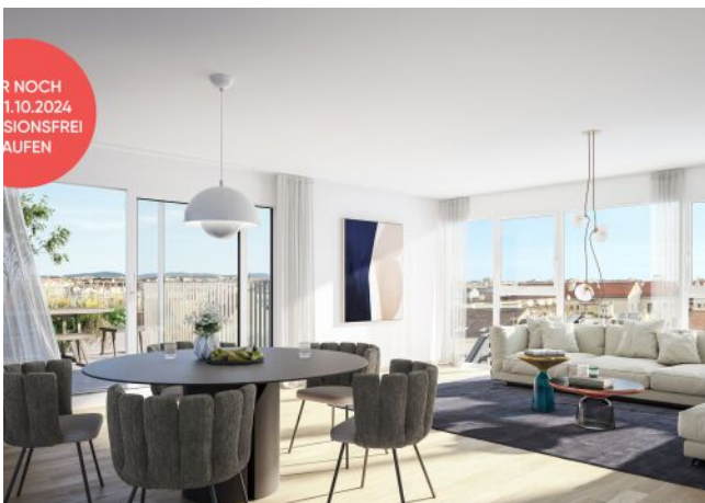
Arndtstraße 50 | Wohnraum