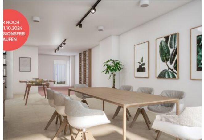
Arndtstraße 50 | Gemeinschaftsraum