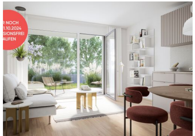
Arndtstraße 50 | Gartenwohnung