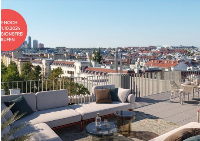
Arndtstraße 50 | Dachterrasse