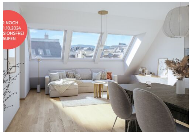
Arndtstraße 50 | Wohnraum