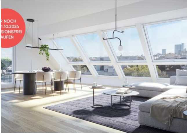
Arndtstraße 50 | Wohnraum