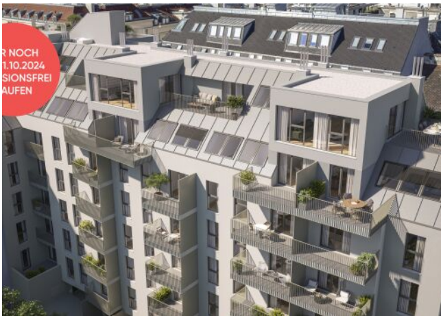
Arndtstraße 50 | Hofansicht