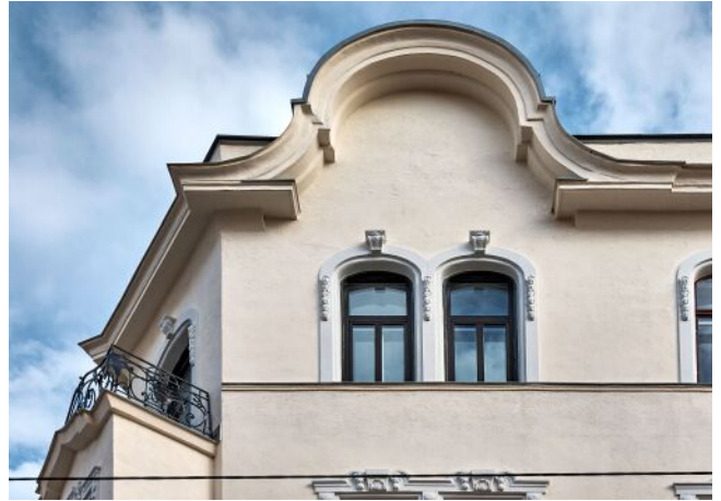
Bergsteiggasse 26A | Fassade