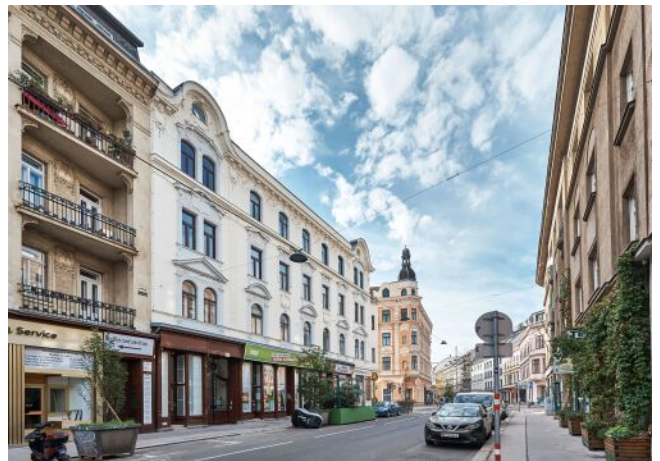
Bergsteiggasse 26A | Hausansicht