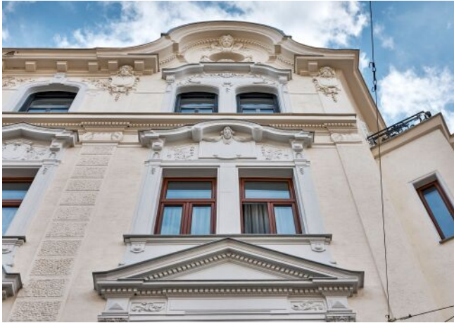
Bergsteiggasse 26A | Fassade