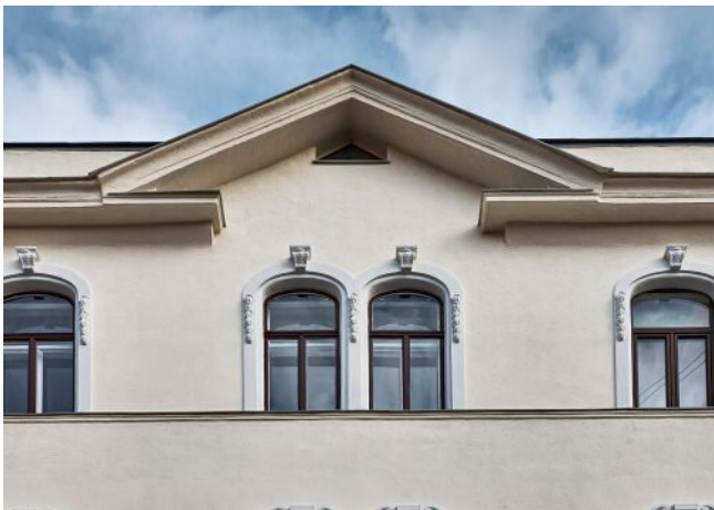
Bergsteiggasse 26A | Fassade