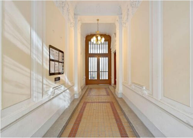
Bergsteiggasse 26A | Hauseingang