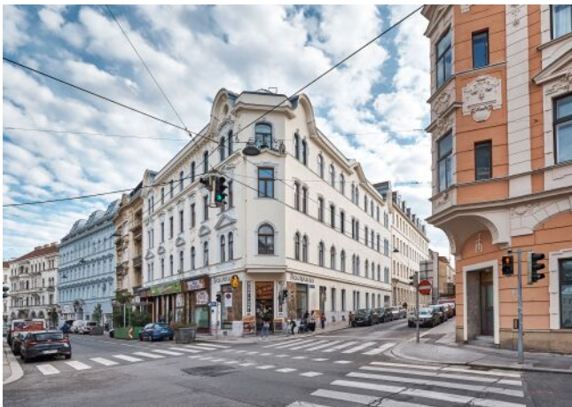
Bergsteiggasse 26A | Hausansicht