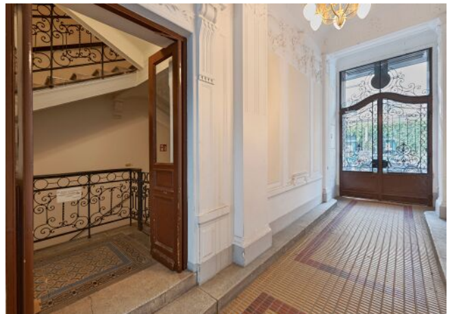
Bergsteiggasse 26A | Hauseingang