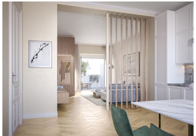
Essenz No. 1 | Wohnraum Regelgeschoss