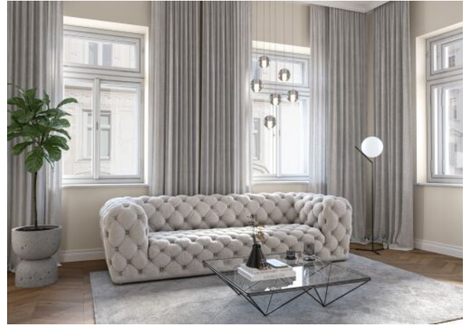
Essenz No. 1 | Wohnraum Regelgeschoss