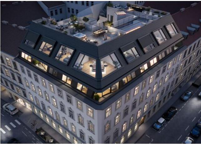
Essenz No. 1 | Fassade Oben