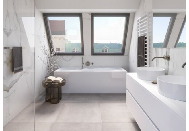
Essenz No. 1 | Bad Dachgeschoss