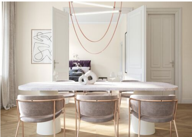
Essenz No. 1 | Wohnraum Regelgeschoss