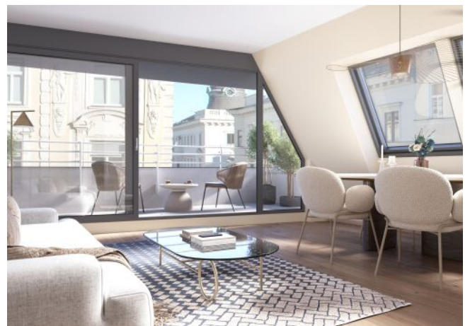
Essenz No. 1 | Wohnraum Dachgeschoss