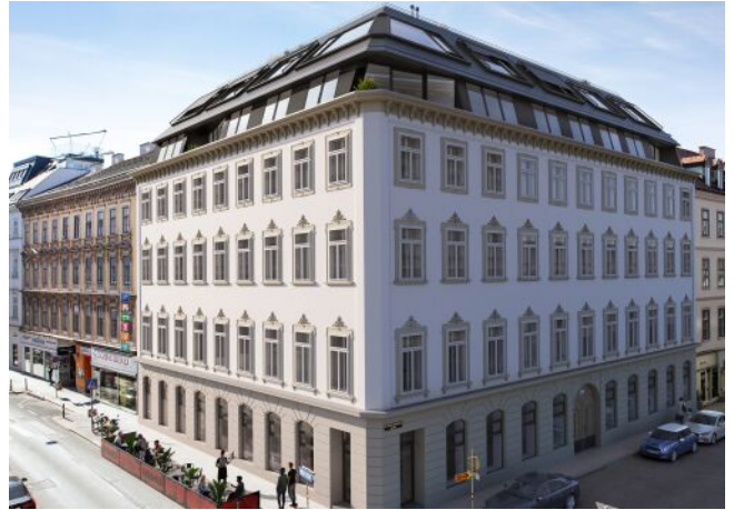
Essenz No. 1 | Fassade Tag