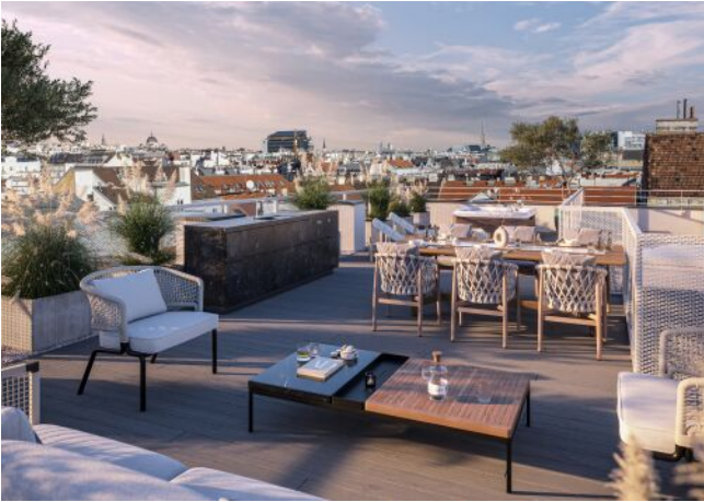
Essenz No. 1 | Dachterrasse