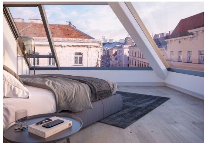
Essenz No. 1 | Schlafzimmer Dachgeschoss