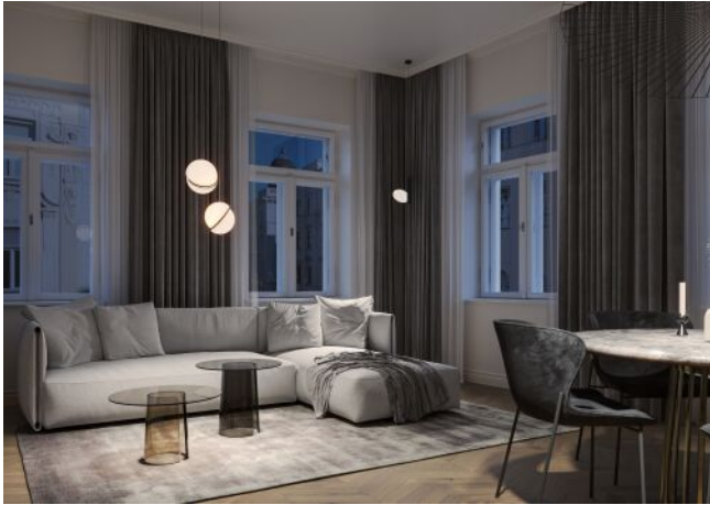
Essenz No. 1 | Wohnraum Regelgeschoss