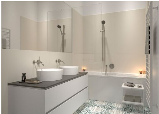
Essenz No. 1 | Badezimmer Regelgeschoss