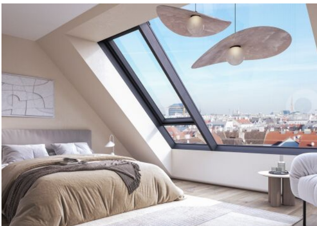
Essenz No. 1 | Schlafzimmer Dachgeschoss