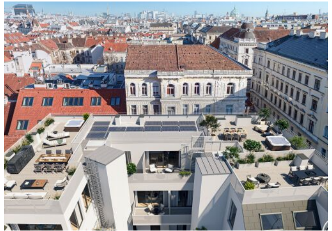
Essenz No. 1 | Hof