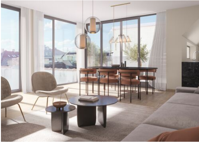
Essenz No. 1 | Wohnraum Dachgeschoss