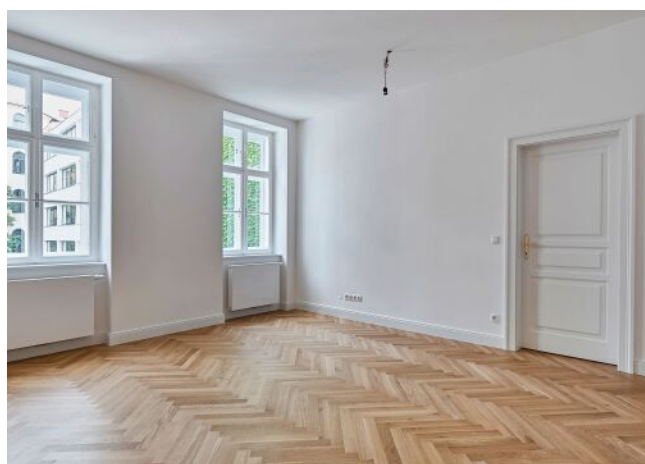
Esterhazygasse 28 | Wohnung