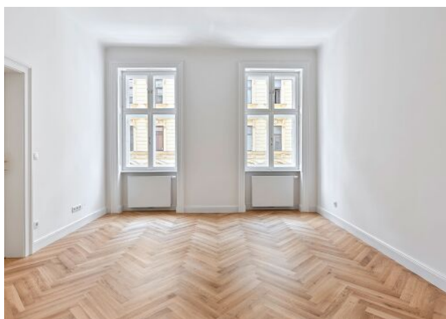
Esterhazygasse 28 | Wohnung