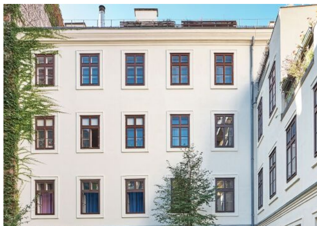
Esterhazygasse 28 | Hof