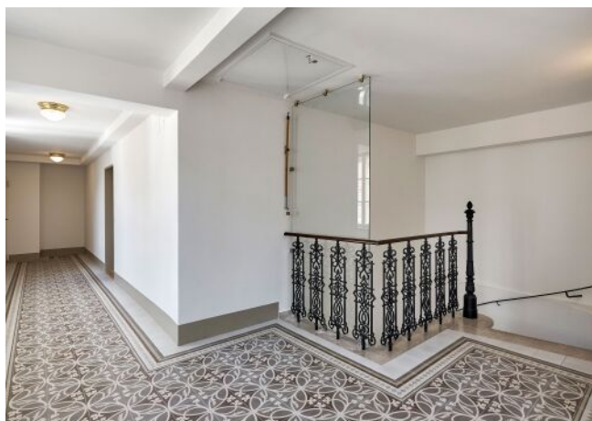
Esterhazygasse 28 | Stiegenhaus