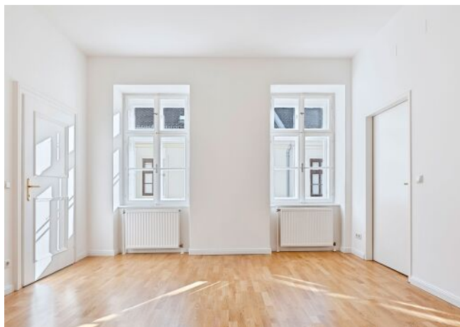
Esterhazygasse 28 | Wohnung