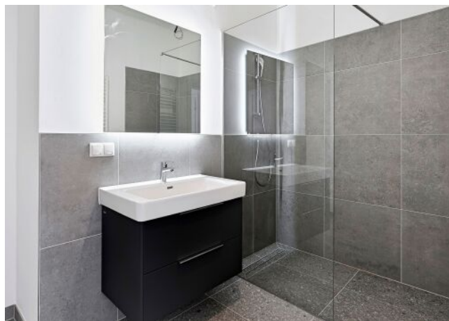
Esterhazygasse 28 | Badezimmer