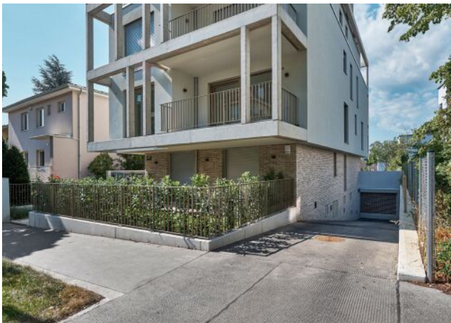
Greenhill Suites | Fassade