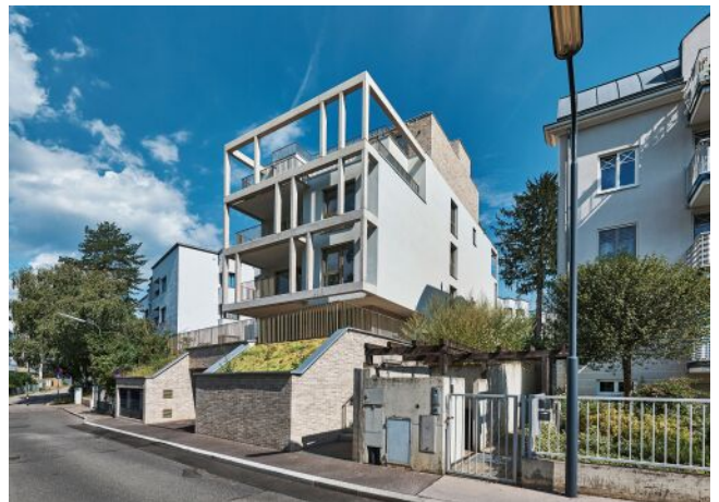
Greenhill Suites | Fassade