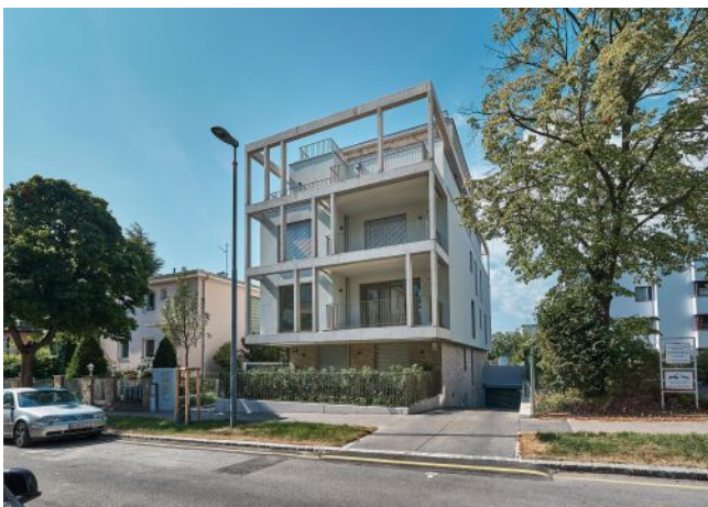
Greenhill Suites | Fassade