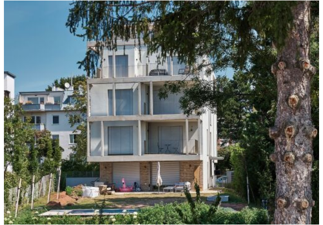
Greenhill Suites | Grünruhelage