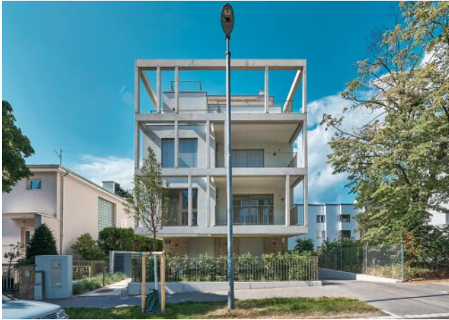
Greenhill Suites | Fassade