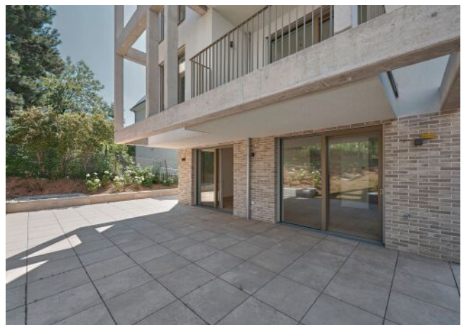
Greenhill Suites | Fassade