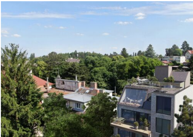
Herbeckstraße 130 | Vogelperspektive