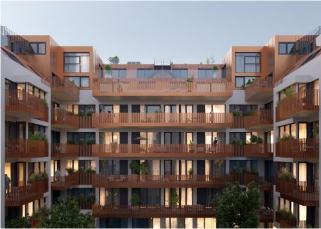
Herbststraße 6-10 | Hof