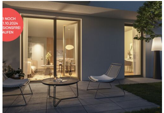
Ottakringer Straße 26 | Gartenwohnung