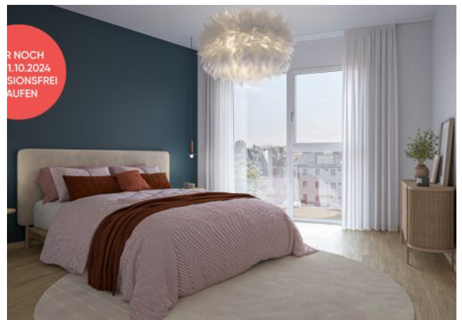
Ottakringer Straße 26 | Schlafzimmer