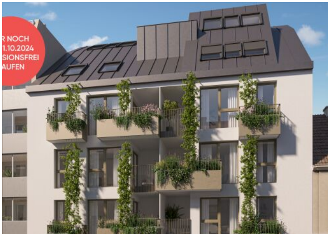
Veronikagasse 31 | Fassade