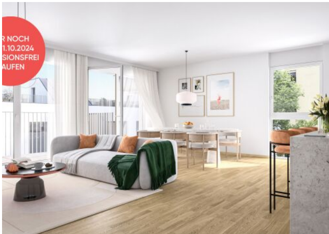
Ottakringer Straße 26 | Wohnzimmer