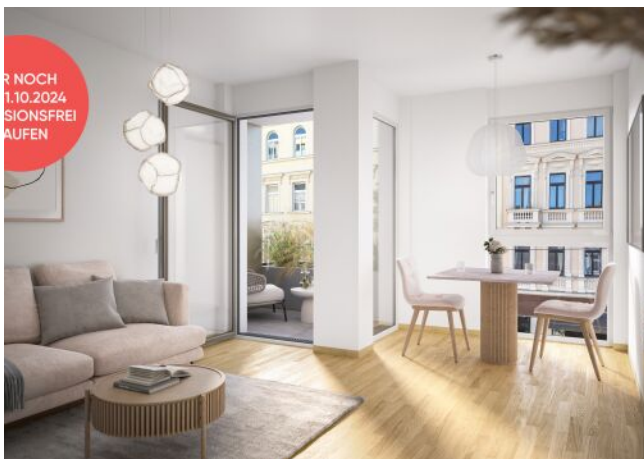
Ottakringer Straße 26 | Wohnraum