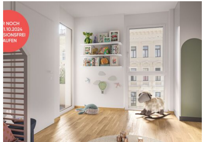
Ottakringer Straße 26 | Kinderzimmer