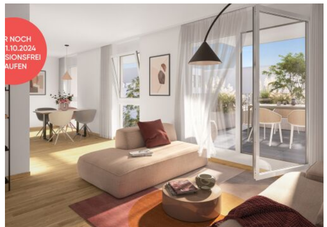
Ottakringer Straße 26 | Wohnzimmer