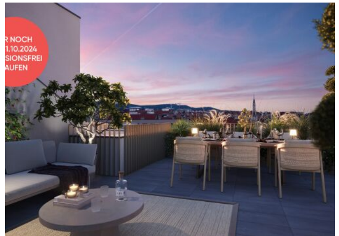
Ottakringer Straße 26 | Dachterrasse