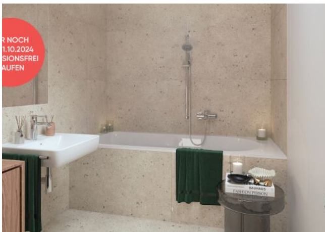
Ottakringer Straße 26 | Badezimmer