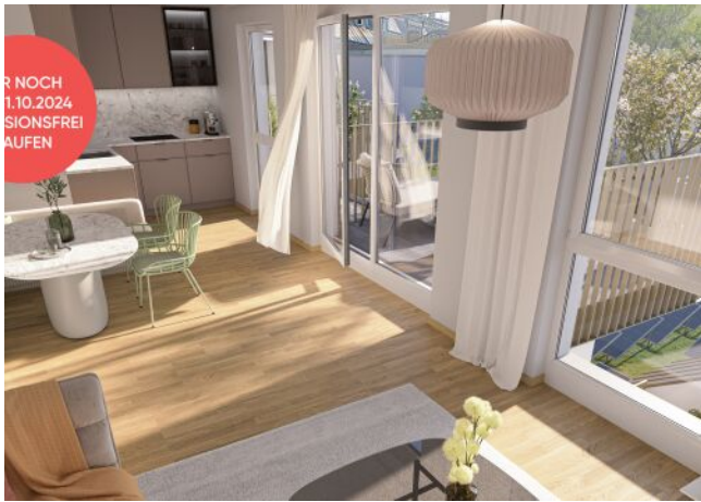
Ottakringer Straße 26 | Wohnraum