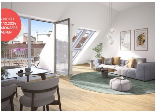
Ottakringer Straße 26 | Lebensraum