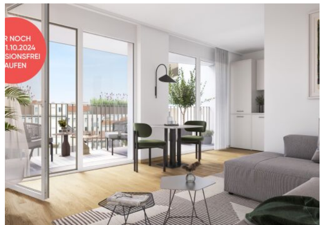
Ottakringer Straße 26 | Wohnzimmer