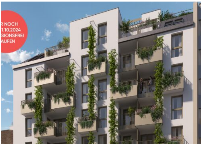
Ottakringer Straße 26 | Fassade