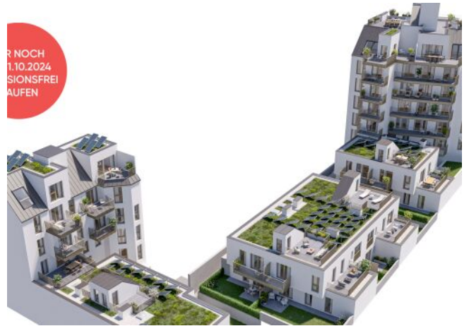
Ottakringer Straße 26 | Vogelperspektive