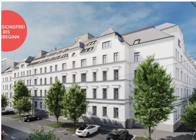
Rosegggasse | Fassade Tag