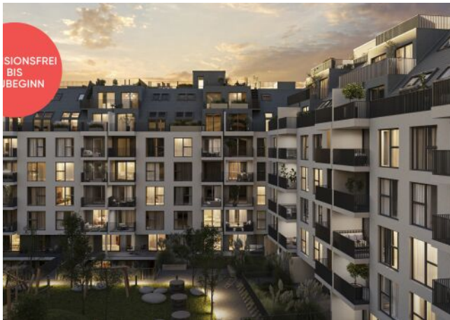
Rosegggasse | Hof Abend