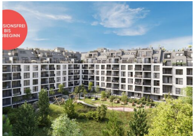
Rosegggasse | Hof Tag