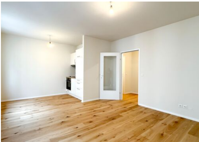
Schöffergasse 18-20 | Wohnraum