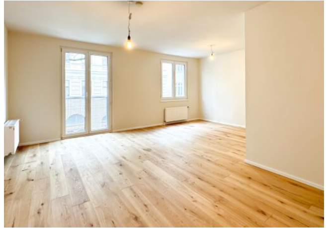
Schöffergasse 18-20 | Wohnraum