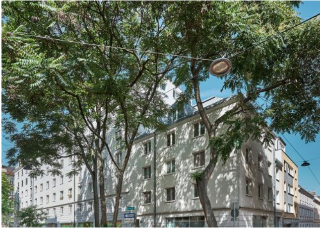
Schöffergasse 18-20 | Fassade