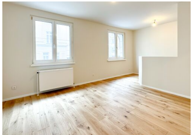
Schöffergasse 18-20 | Wohnraum