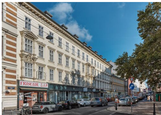
Schönbrunner Straße 20-24 | Fassade