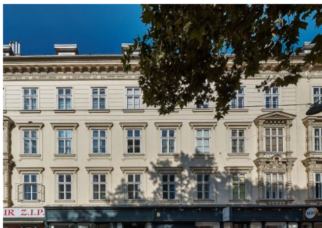
Schönbrunner Straße 20-24 | Fassade