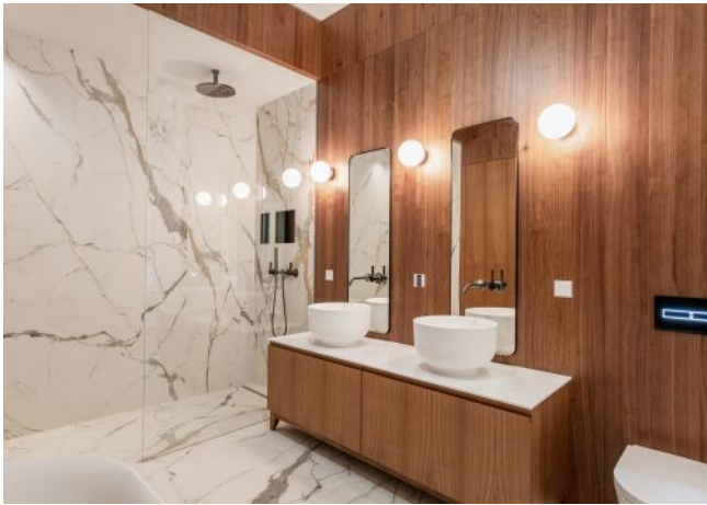
Wattmannngasse 25 | Badezimmer