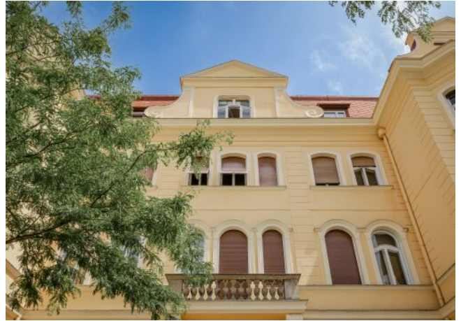
Wattmannngasse 25 | Fassade