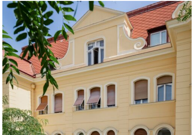
Wattmannngasse 25 | Fassade