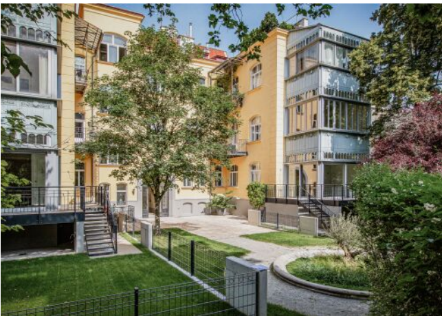
Wattmannngasse 25 | Garten