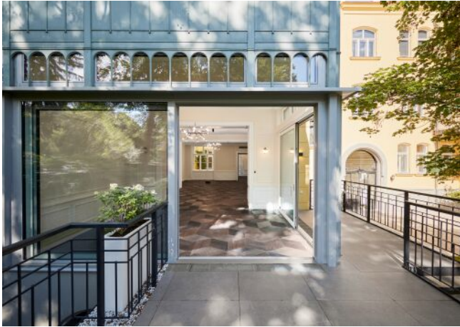
Wattmannngasse 25 | Wohnraum