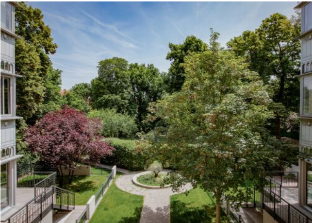
Wattmannngasse 25 | Gartenparadies