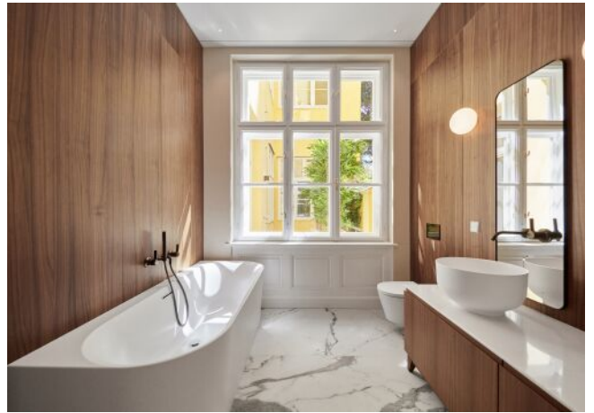
Wattmannngasse 25 | Badezimmer