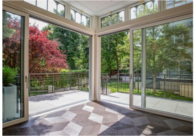
Wattmannngasse 25 | Terrasse