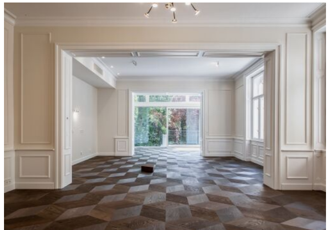
Wattmannngasse 25 | Wohnraum