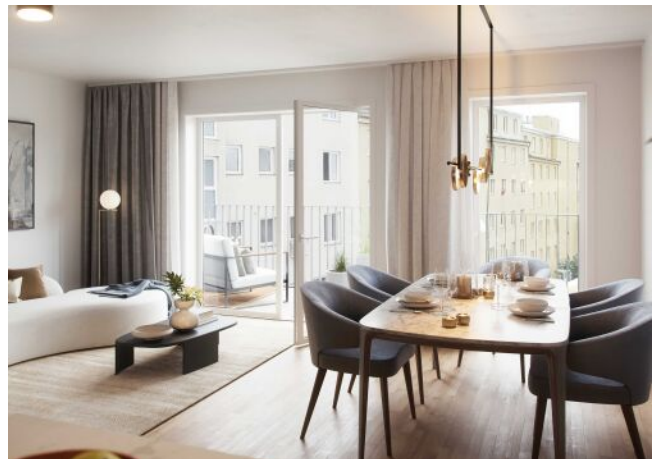
Wiedner Hauptstrasse 140 | Wohnraum