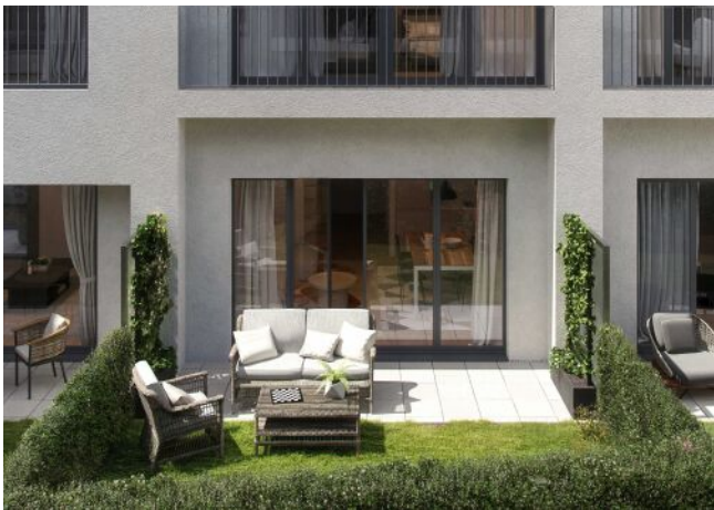
Wiedner Hauptstrasse 140 | Garten