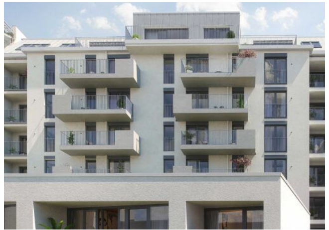
Wiedner Hauptstrasse 140 | Fassade Hof