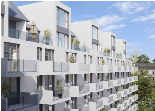
Am Spitz 5 | Hof