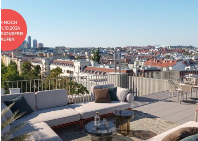
Arndtstraße 50 | Dachterrasse