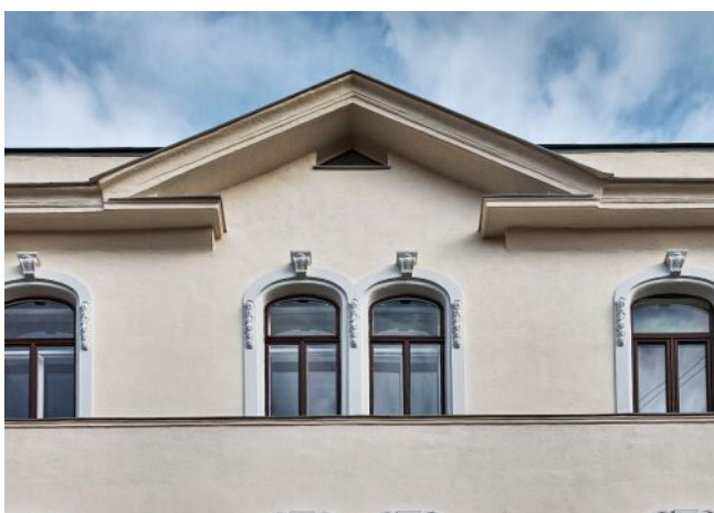
Bergsteiggasse 26A | Fassade