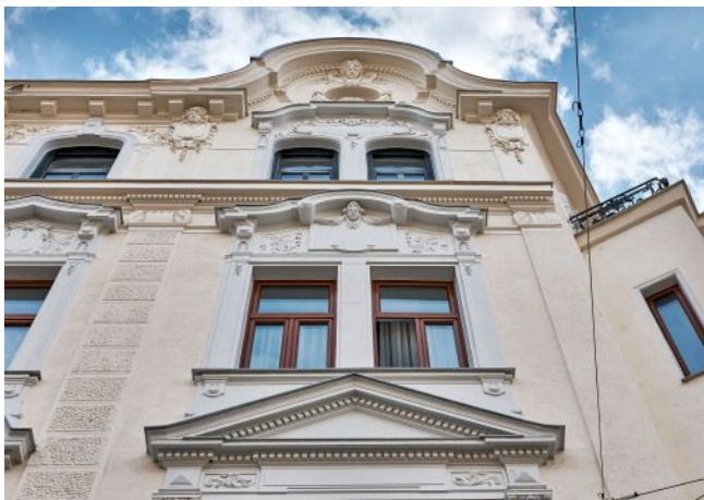
Bergsteiggasse 26A | Fassade