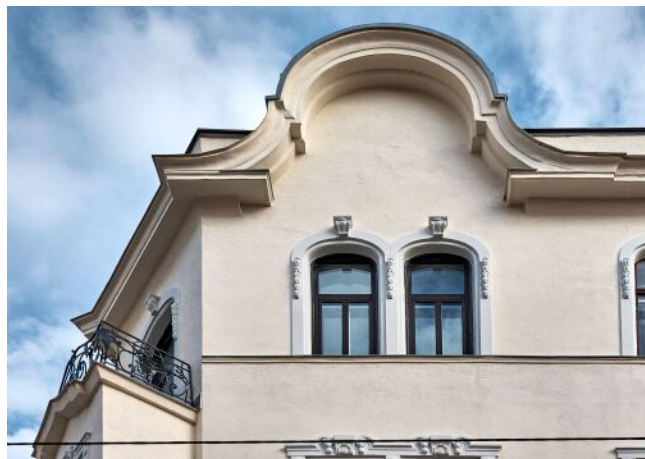
Bergsteiggasse 26A | Fassade