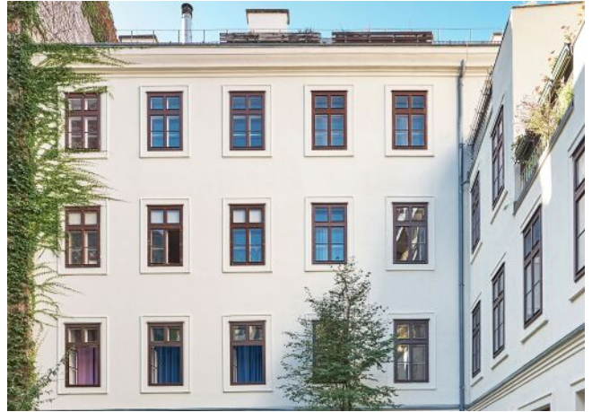
Esterhazygasse 28 | Hof