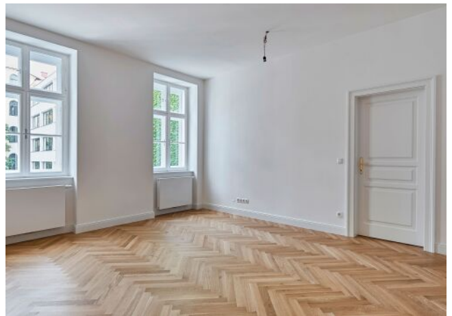
Esterhazygasse 28 | Wohnung