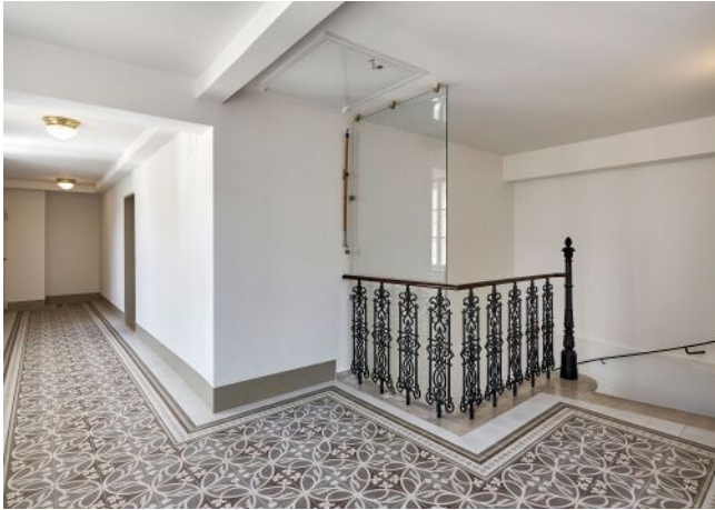
Esterhazygasse 28 | Stiegenhaus