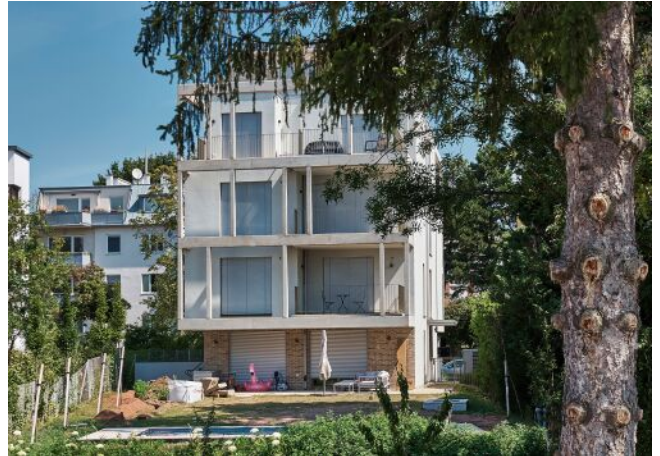
Greenhill Suites | Grünruhelage