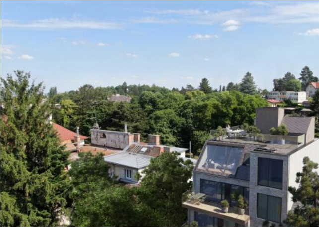
Herbeckstraße 130 | Vogelperspektive