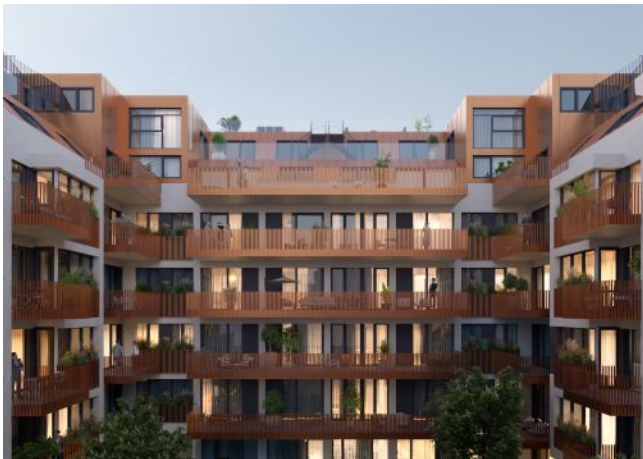
Herbststraße 6-10 | Hof