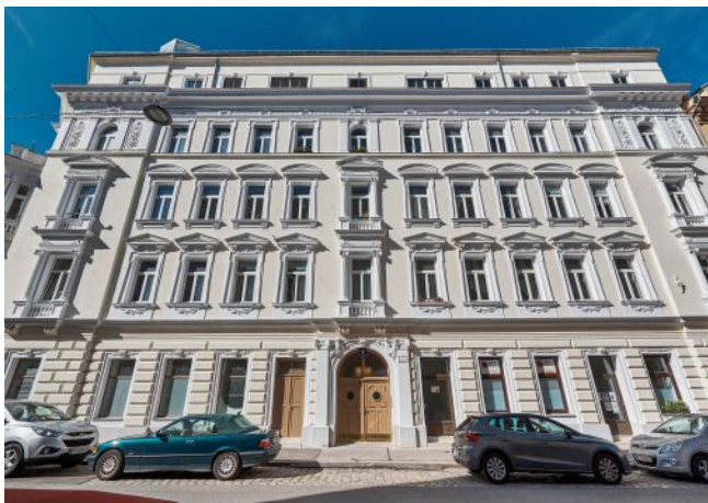
Leibenfrostgasse 8 | Fassade