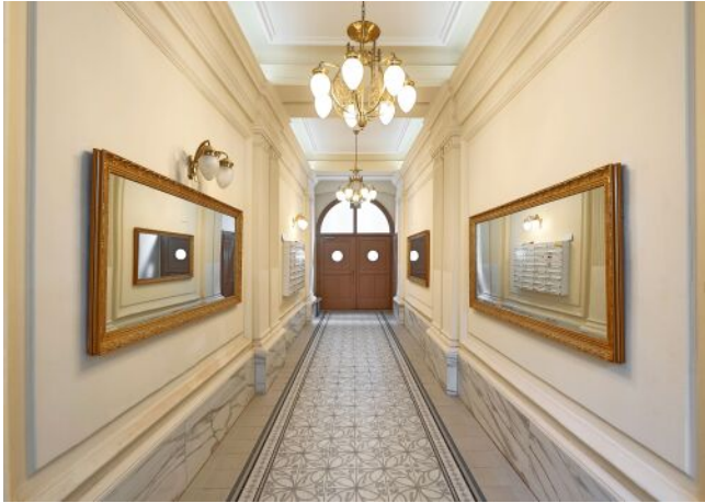
Leibenfrostgasse 8 | Hauseingang