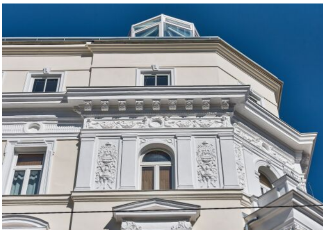
Leibenfrostgasse 8 | Fassade Detail