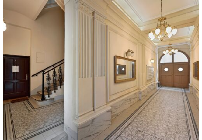
Leibenfrostgasse 8 | Hauseingang