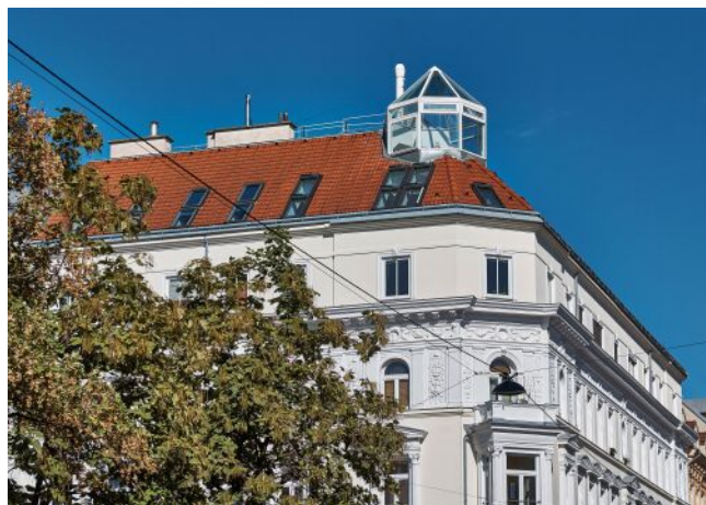
Leibenfrostgasse 8 | Fassade