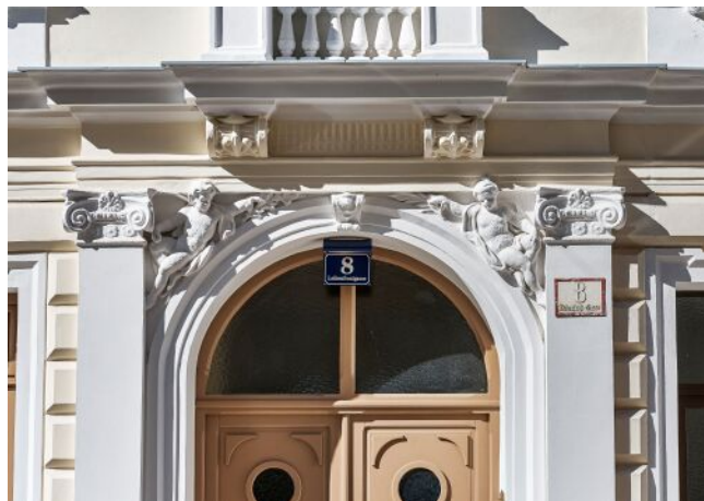
Leibenfrostgasse 8 | Fassade Detail