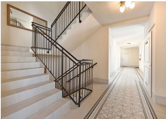
Leibenfrostgasse 8 | Stiegenhaus