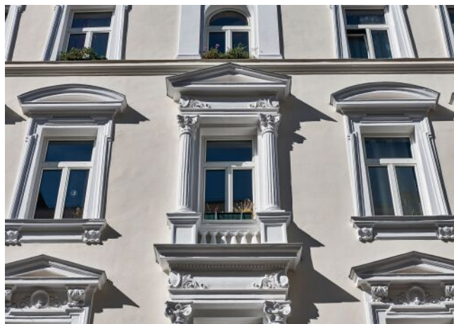
Leibenfrostgasse 8 | Fassade Detail