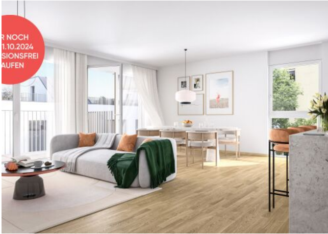
Ottakringer Straße 26 | Wohnzimmer