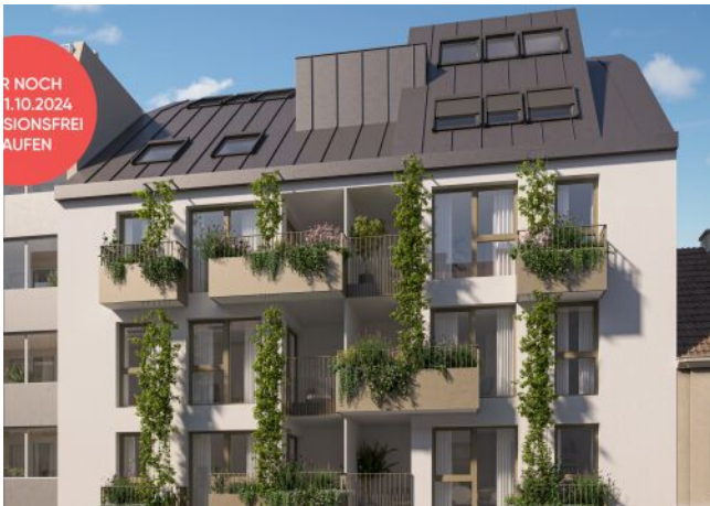
Veronikagasse 31 | Fassade