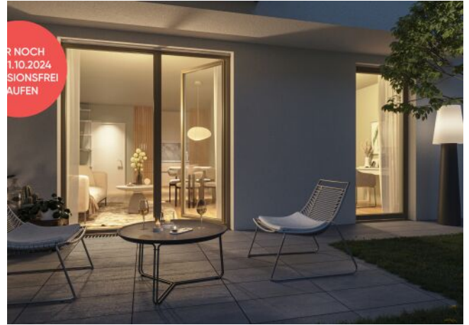
Ottakringer Straße 26 | Gartenwohnung