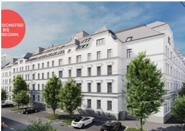
Roseggergasse | Fassade Tag