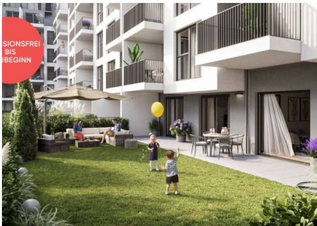
Roseggergasse | Gartenwohnung