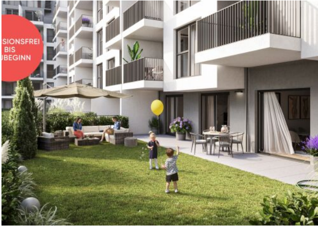
Roseggergasse | Gartenwohnung