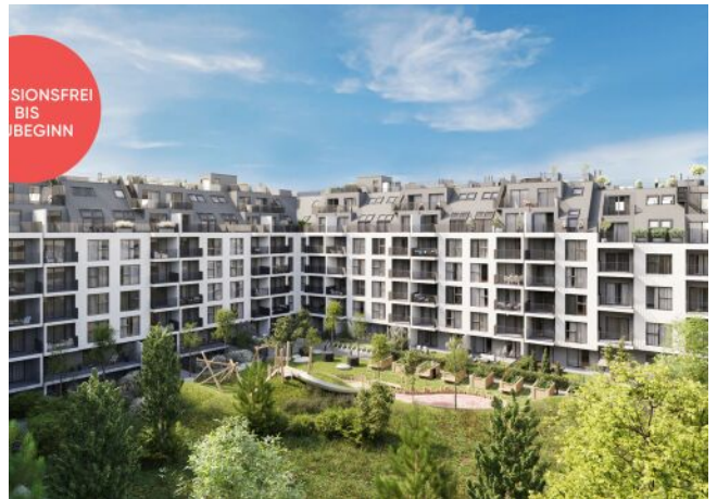
Roseggergasse | Hof Tag