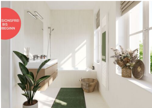
Rosegggasse | Badezimmer