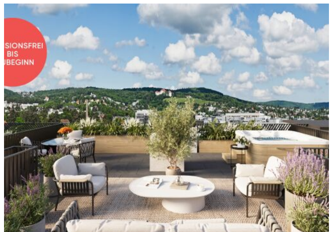
Roseggergasse | Dachterrasse