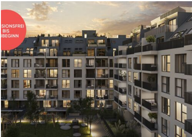
Rosegggasse | Hof Abend