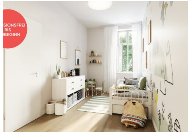
Rosegggasse | Kinderzimmer