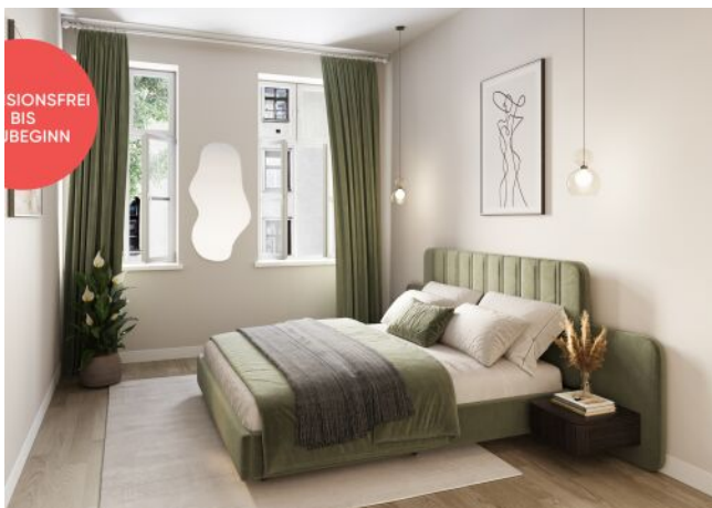
Rosegggasse | Schlafzimmer