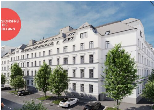
Rosegggasse | Fassade Tag