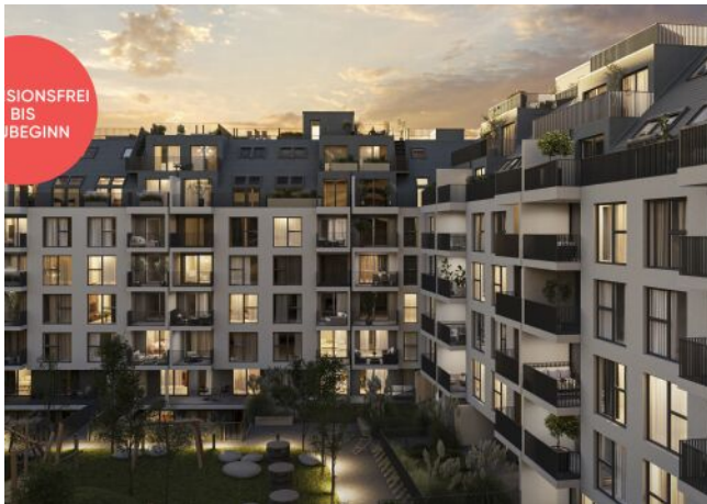
Roseggergasse | Hof Abend