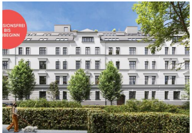
Roseggergasse | Fassade Frontal