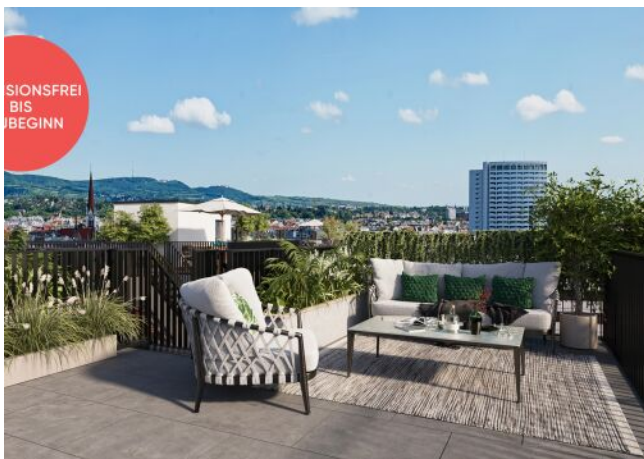
Roseggergasse | Dachterrasse