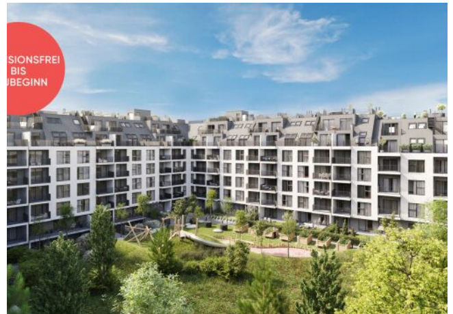
Rosegggasse | Hof Tag