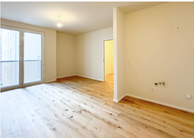
Schäffergasse 18-20 | Wohnraum