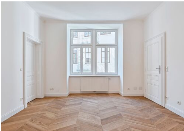
Schönbrunner Straße 20-24 | Wohnraum