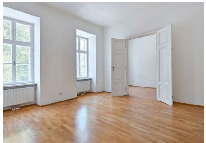
Schönbrunner Straße 20-24 | Wohnraum