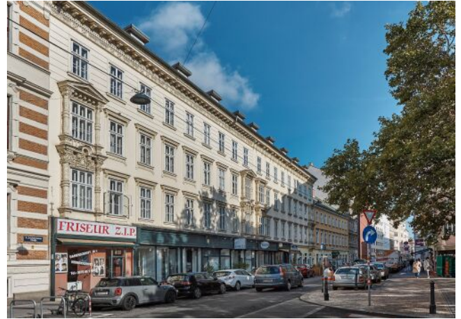
Schönbrunner Straße 20-24 | Fassade