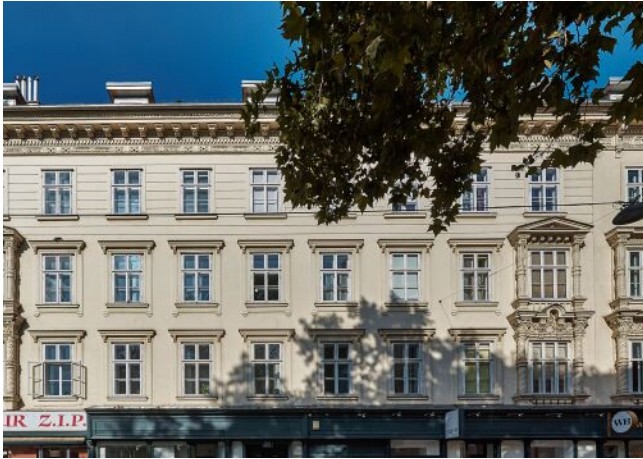
Schönbrunner Straße 20-24 | Fassade