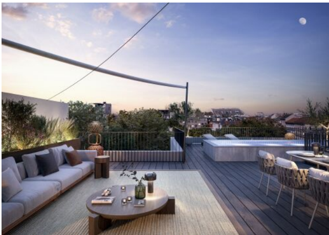
The Legacy | Dachterrasse