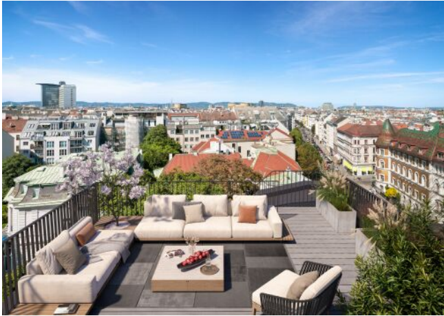
The Legacy | Dachterrasse