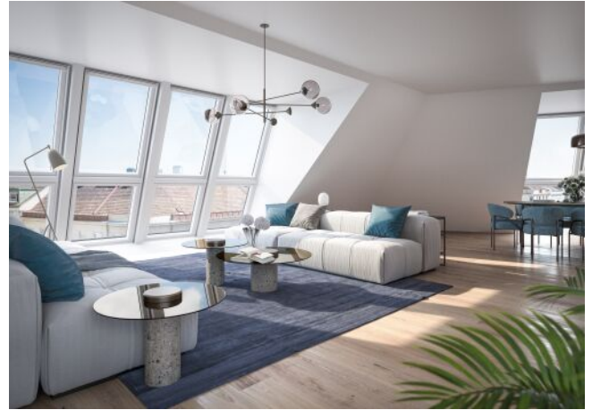
The Legacy | Wohnraum