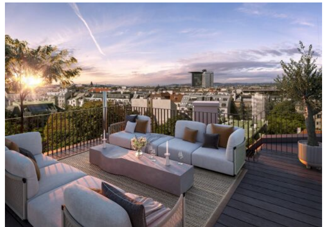
The Legacy | Dachterrasse