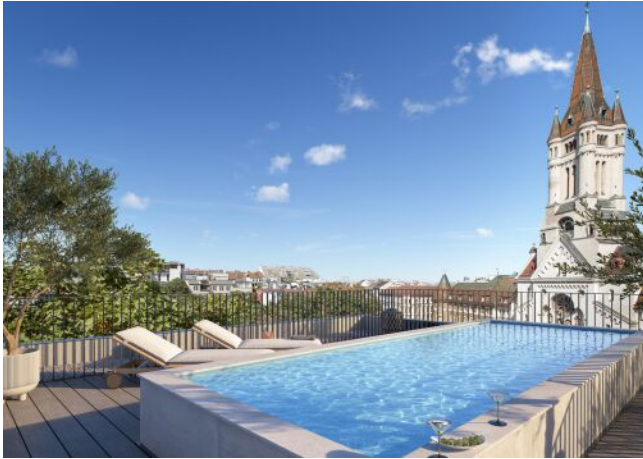
The Legacy | Dachterrasse Pool