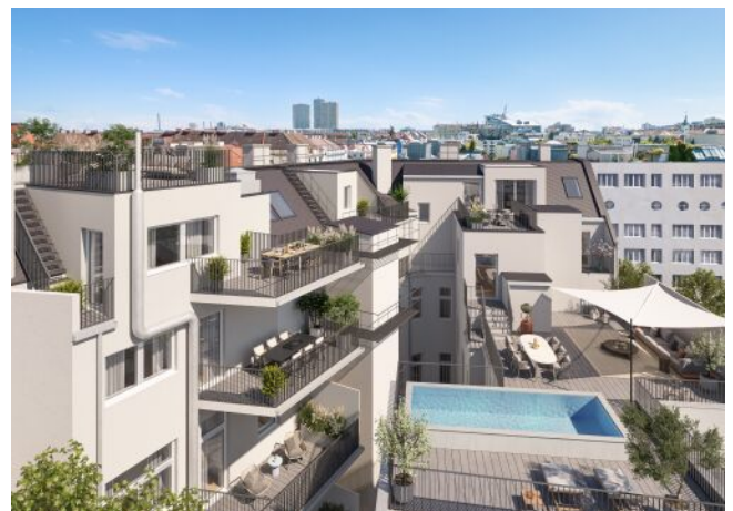
The Legacy | Hof