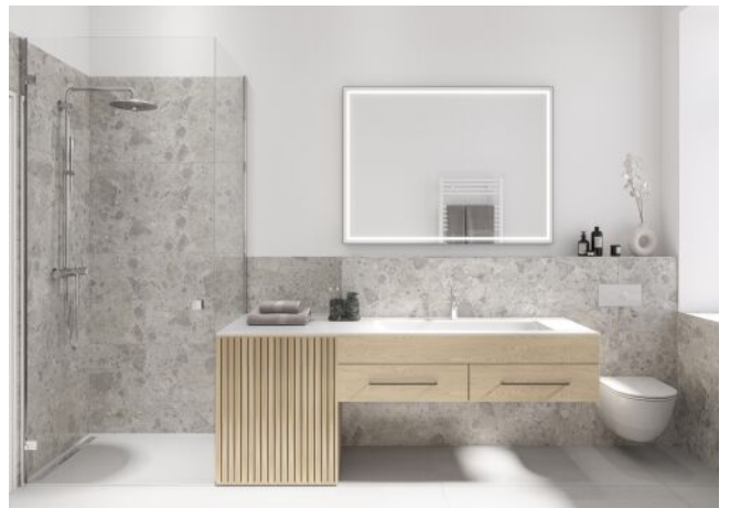
The Legacy | Badezimmer