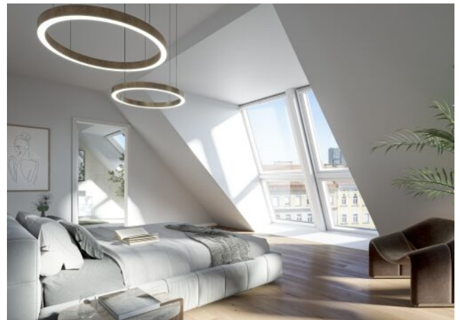
The Legacy | Schlafzimmer