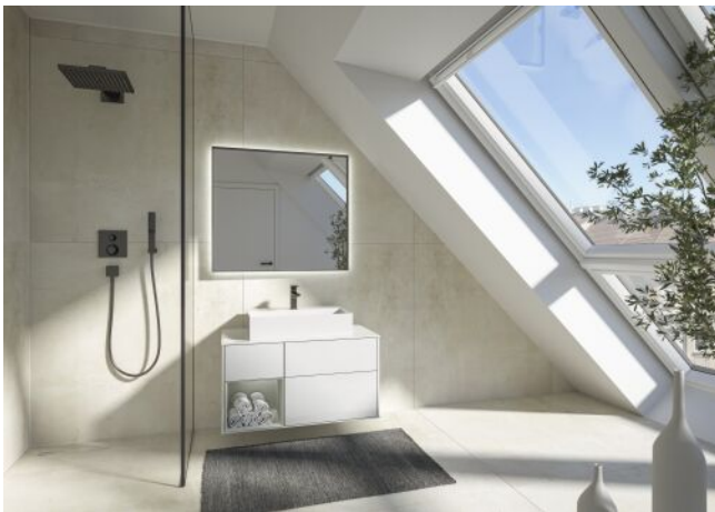
The Legacy | Badezimmer