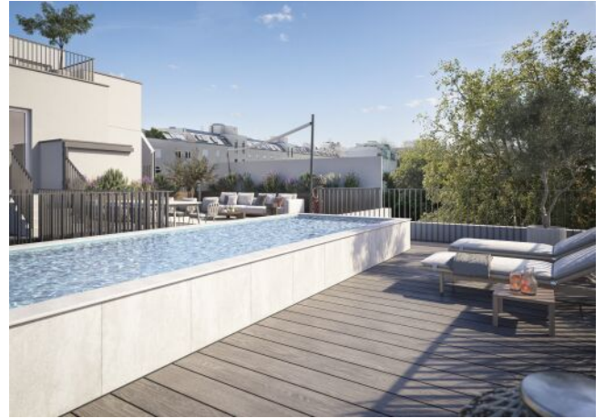
The Legacy | Dachterrasse Pool