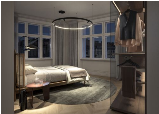
The Legacy | Schlafzimmer