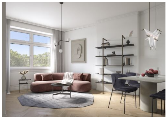
The Legacy | Wohnraum