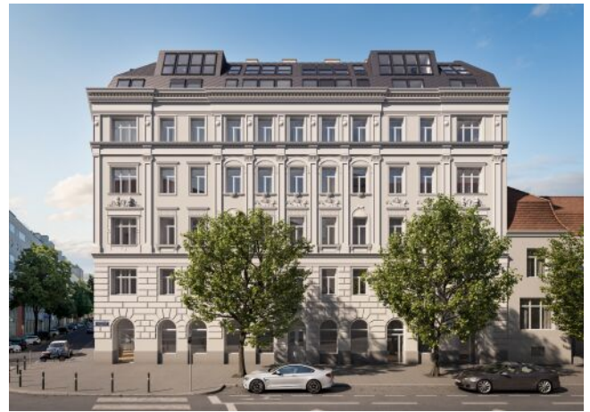
The Legacy | Fassade