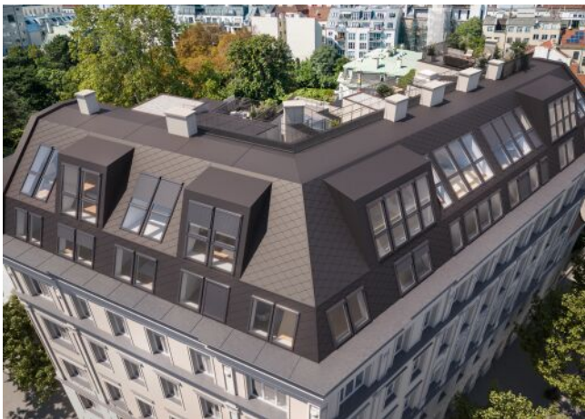
The Legacy | Fassade