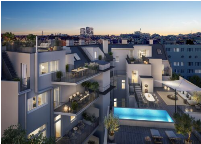
The Legacy | Hof