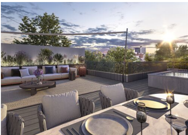
The Legacy | Dachterrasse