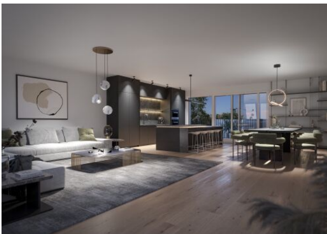
The Legacy | Wohnraum