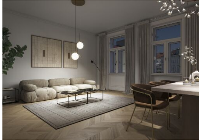
The Legacy | Wohnraum