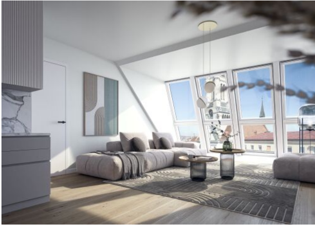
The Legacy | Wohnraum