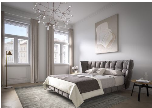
The Legacy | Schlafzimmer