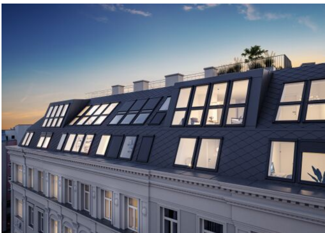
The Legacy | Dachgeschoss