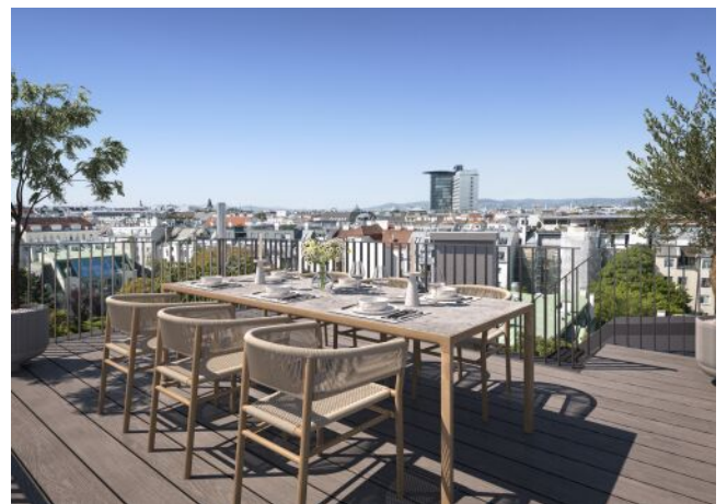
The Legacy | Dachterrasse