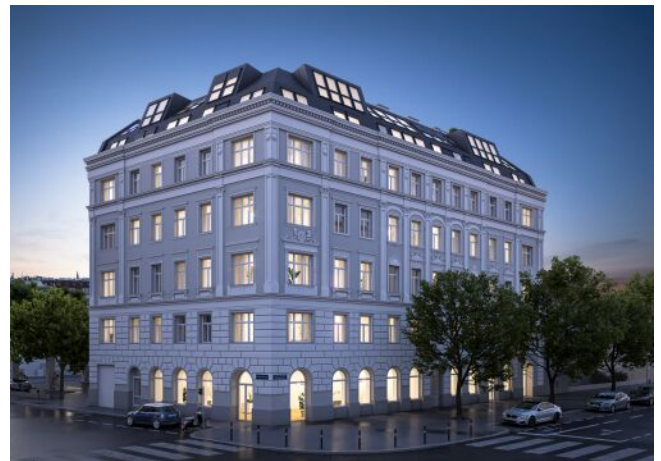
The Legacy | Fassade