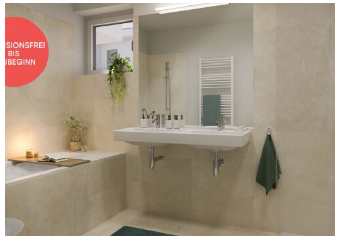
TRAISENGASSE | Badezimmer