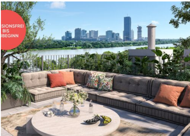
TRAISENGASSE | Dachterrasse Donaublick