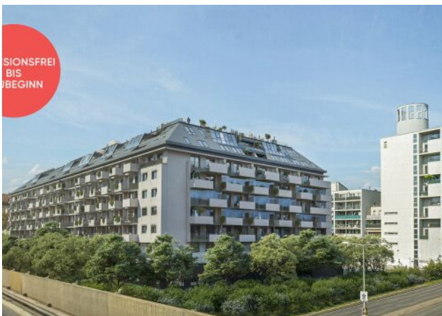
TRAISENGASSE | Eigentum mit Donaublick