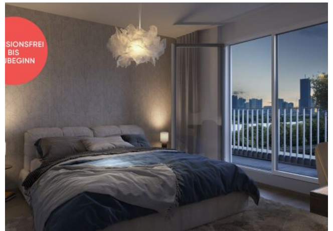
TRAISENGASSE | Schlafzimmer