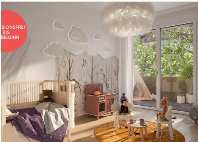
TRAISENGASSE | Kinderzimmer