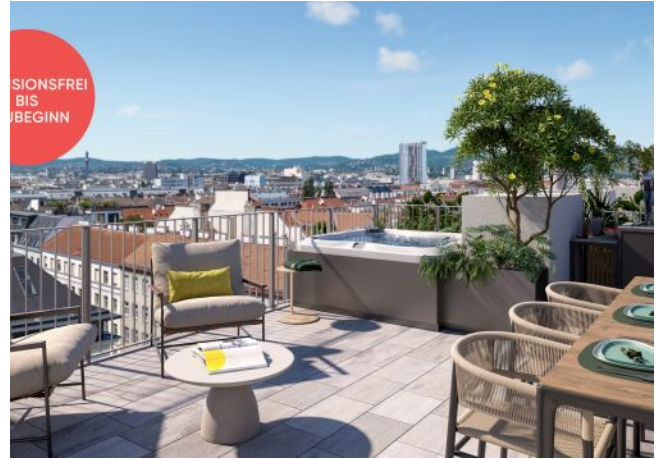
TRAISENGASSE | Dachterrasse mit Stadtblick