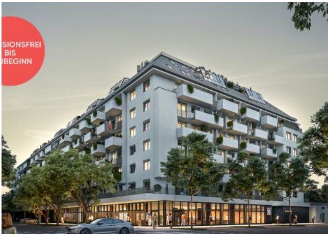
TRAISENGASSE | Nachtansicht