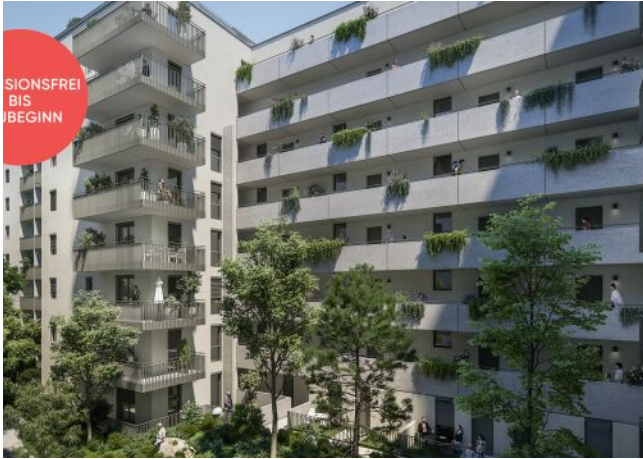
TRAISENGASSE | Innenhof-Ruheoase