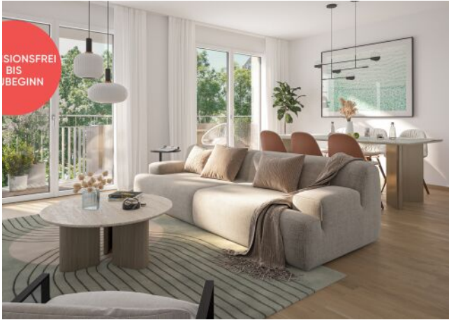
TRAISENGASSE | Lebensraum