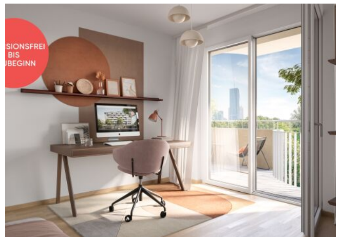
TRAISENGASSE | Home Office