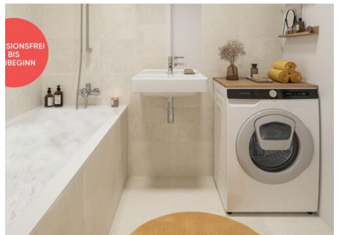
TRAISENGASSE | Badezimmer