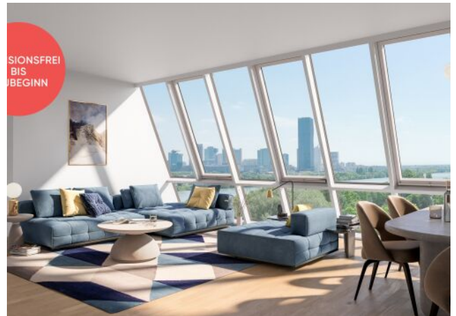
TRAISENGASSE | Penthouse Donaublick