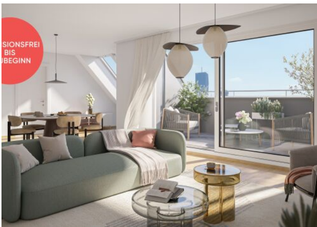
TRAISENGASSE | Wohnzimmer mit Donaublick