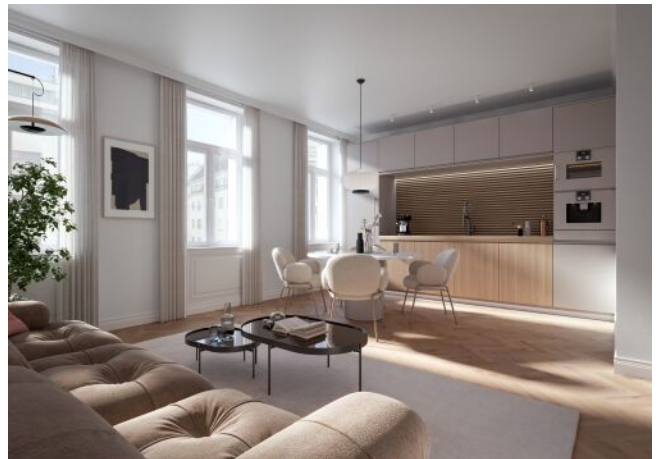
Vivienne | Wohnraum