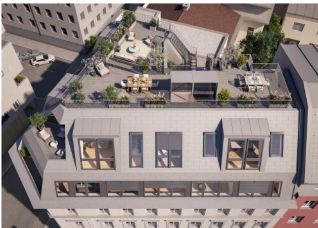
Vivienne | Fassade Tag