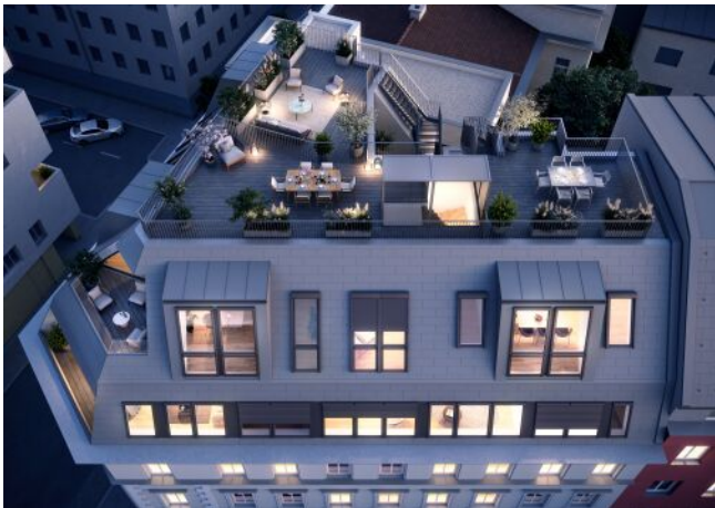
Vivienne | Fassade Nacht