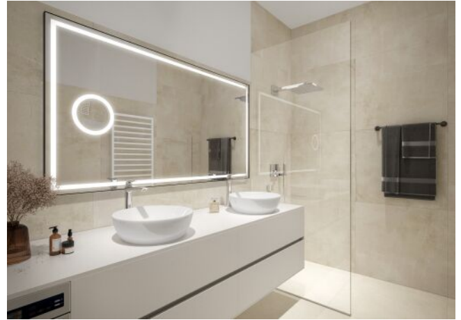
Vivienne | Badezimmer