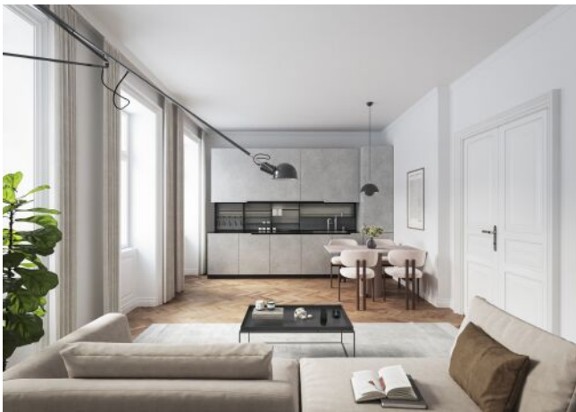
Vivienne | Wohnraum