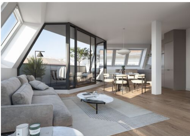
Vivienne | Wohnraum