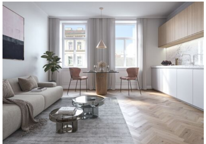
Vivienne | Wohnraum