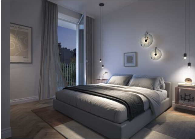
Vivienne | Schlafzimmer