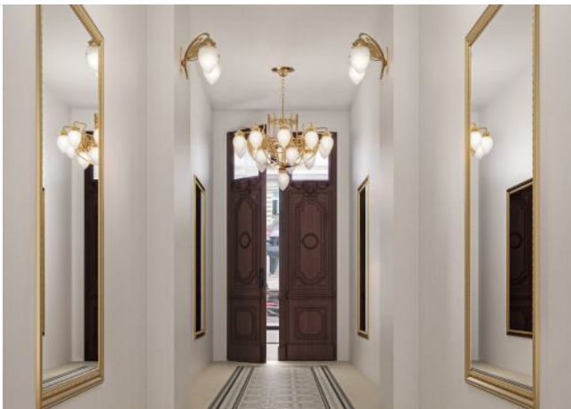
Vivienne | Hauseingang