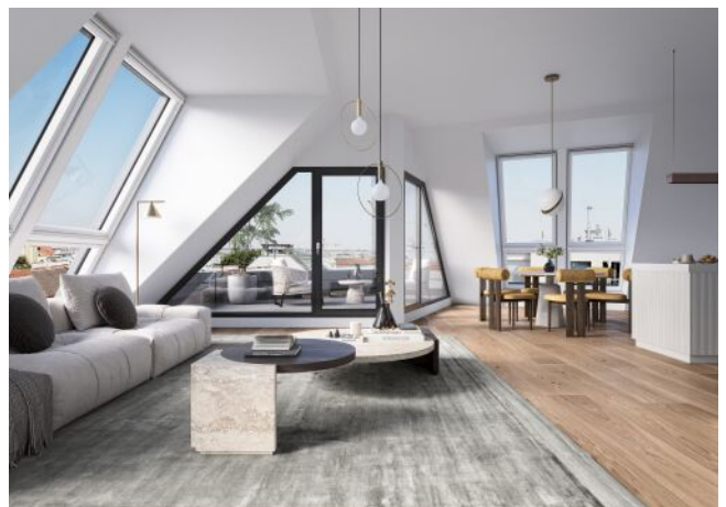
Vivienne | Wohnraum