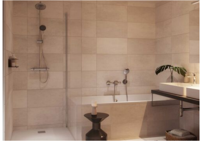
Wiedner Hauptstrasse 140 | Badezimmer