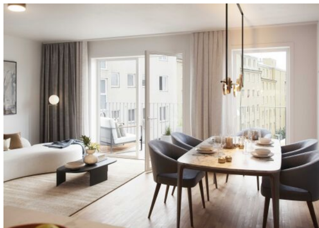
Wiedner Hauptstrasse 140 | Wohnraum