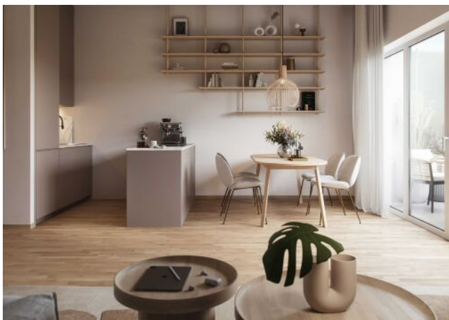
Wiedner Hauptstrasse 140 | Wohnraum