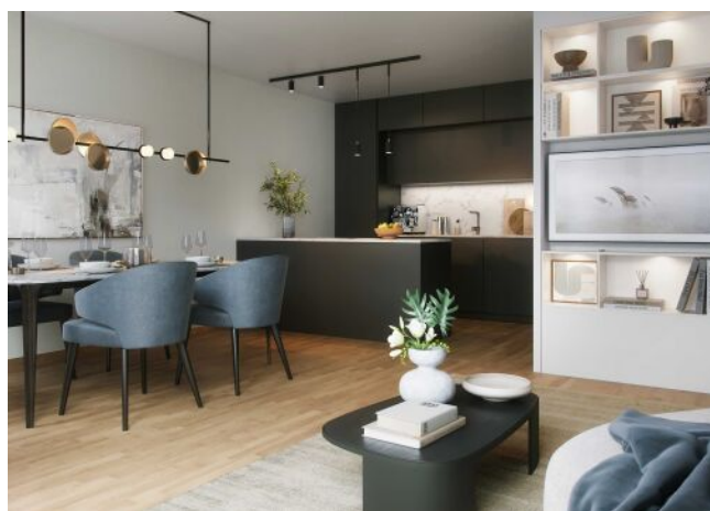
Wiedner Hauptstrasse 140 | Wohnraum