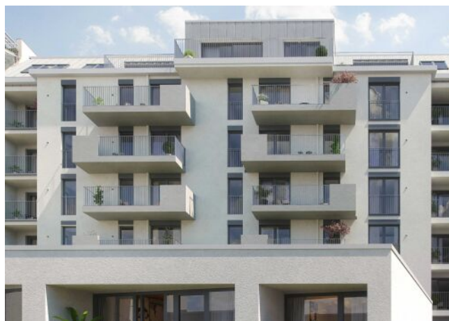
Wiedner Hauptstrasse 140 | Fassade Hof