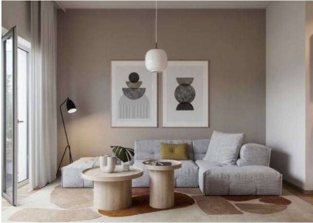
Wiedner Hauptstrasse 140 | Wohnraum