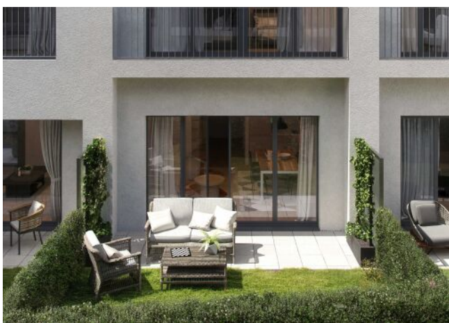
Wiedner Hauptstrasse 140 | Garten